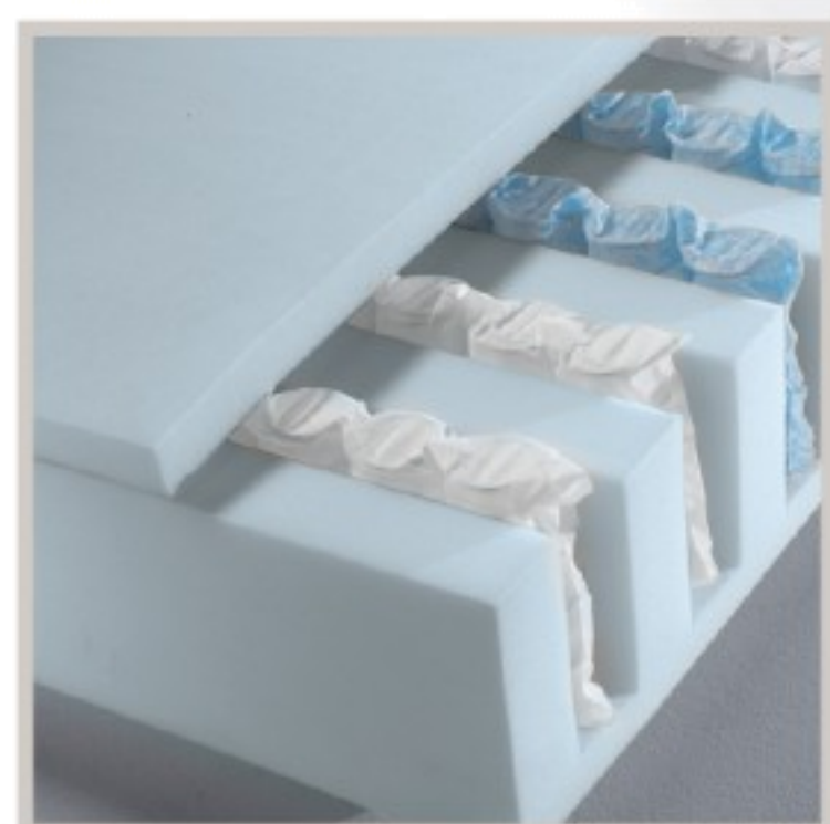
Portanza Rigida Firm carry capacity