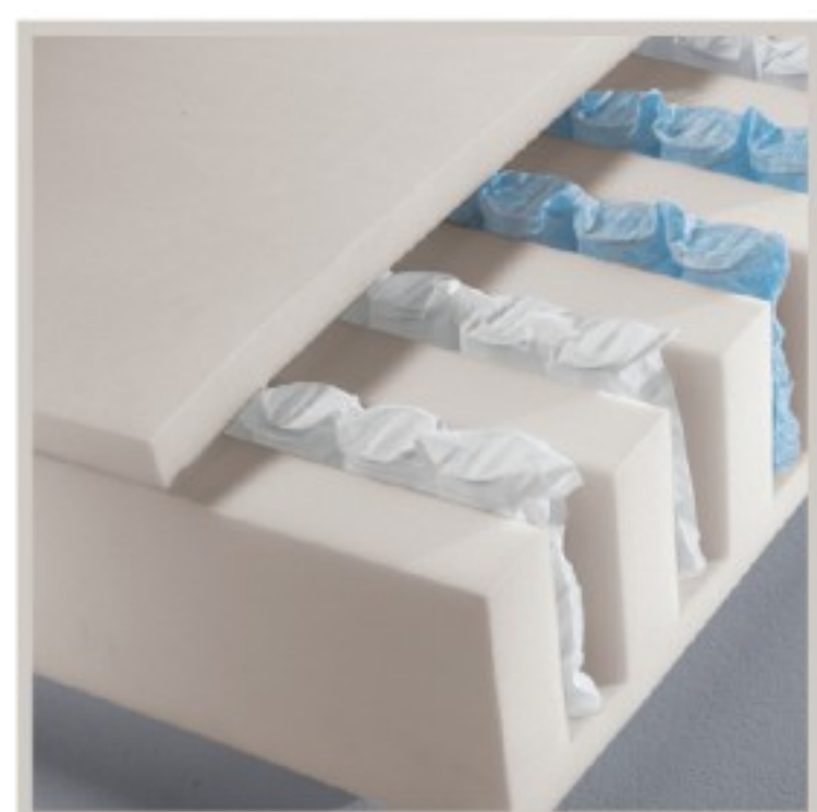
Portanza Soffice Soft carry capacity